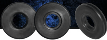
incl. drive wheel Art-No.: 55-020