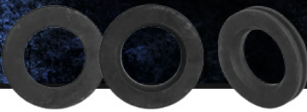
incl. drive wheel Art-No.: 55-010